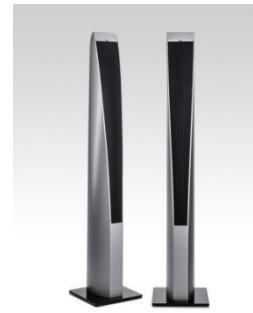
Revox Scala 120 silver