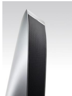
Revox Scala 120 Detail