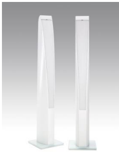
Revox Scala 120 white

Our sound engineers developed a special milling process and a coordinated gluing and pressing system specifically for the production of our highly complex wooden speaker cabinets. The speaker cabinet walls, made of glue-laminated layers of wood, are stiffened multiple times and shaped to prevent the formation of additional standing waves. The appeal of the Scala lies in its handcrafted finishing of the finest quality.