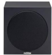
Revox Piccolo S60 black