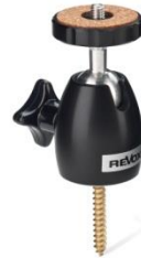
Wall bracket Piccolo S60