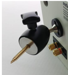
Wall bracket Piccolo S60