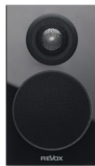
Mini G50 front