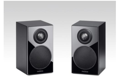
Mini G50 with black housing