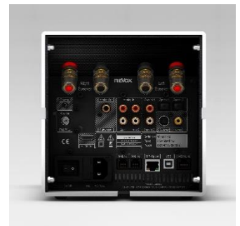
Revox M100 connections