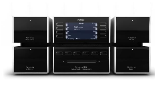
Revox M100 expanded by modules